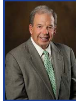
Park Price Term Expires July 1, 2022